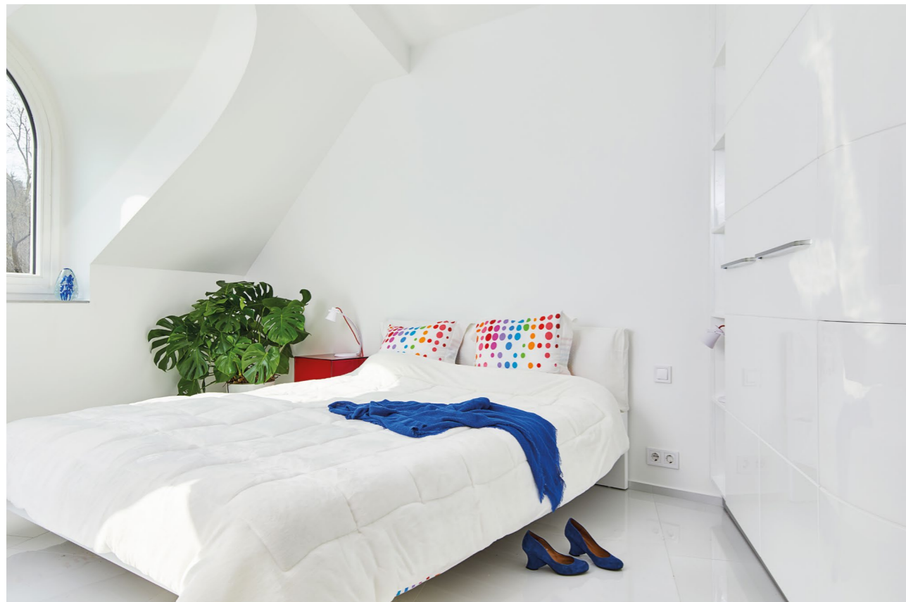
Hamori and Szinger designed a floating bed and curved cabinet for one of the bedrooms