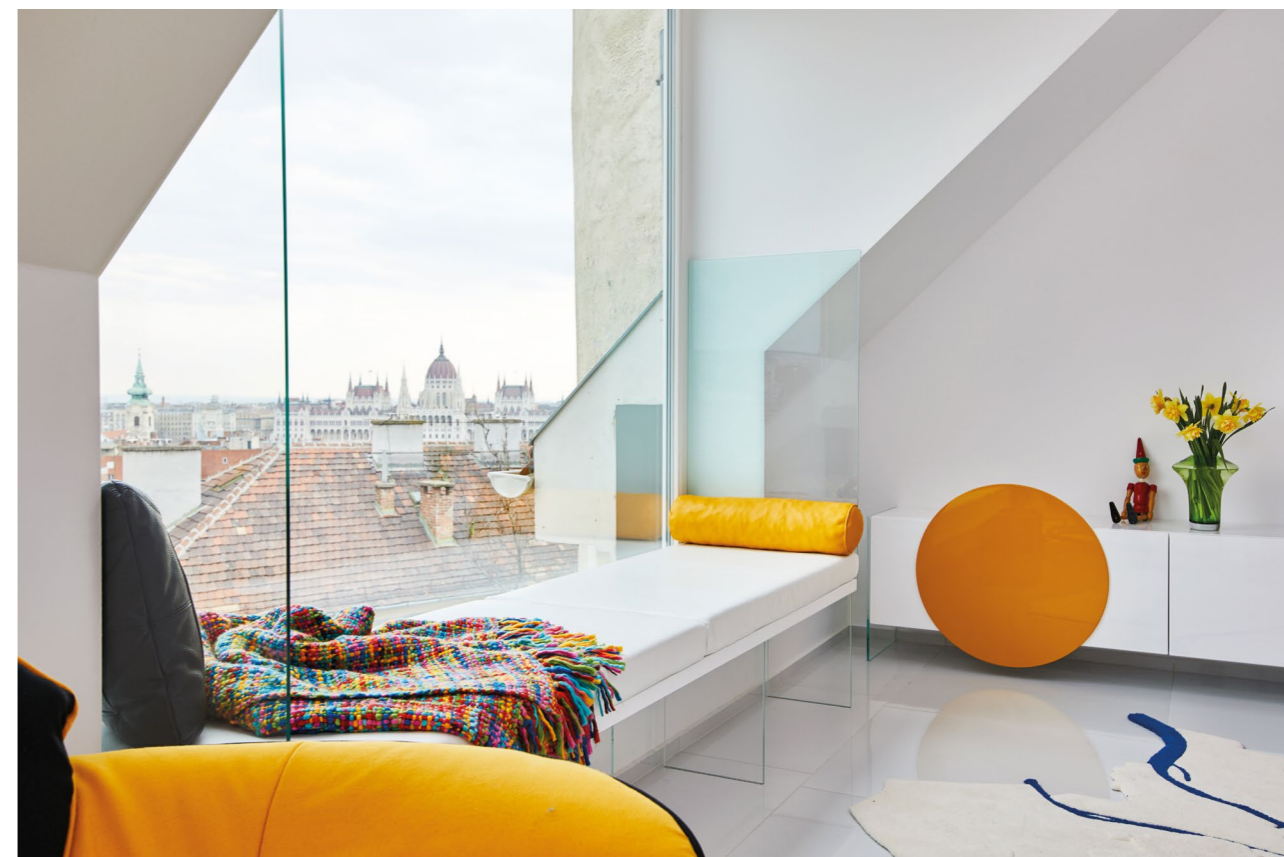
ABOVE The apartment is located in a 1928 building that overlooks the city's parliament building and the Danube BELOW In the dining area, a Leolux table, surrounded by Kartell chairs creates a composition that reminds one of a flower with bright red petals

They probably won't have long to wait: Margeza's one-of-a-kind style properties are quick to draw investors' attention. "Our unique design, along with the excellent locations of our properties, offers buyers great