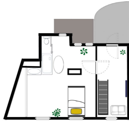
The 110 sq-m, two-level apartment is in the historic centre of Budapest