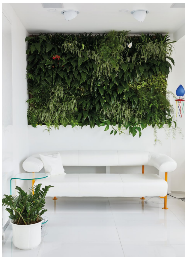
A vertical green wall, fed by an automatic irrigation system, brings a little nature into the apartment