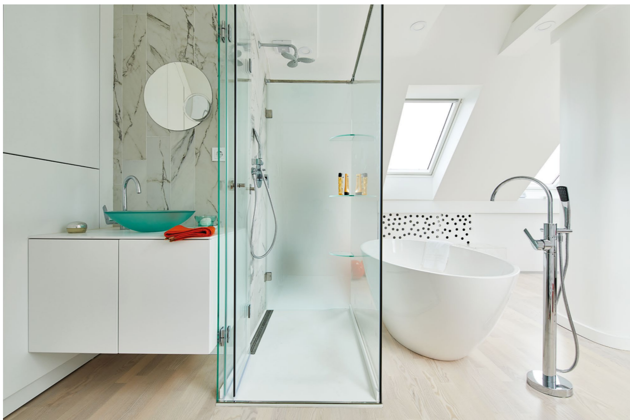
ABOVE Materials such as metal and glass in the bathroom pay homage to Memphis style BELOW A white background allows for the use bold colours. Loose furniture and accessories can be easily changed to reflect the preferences of a new owner