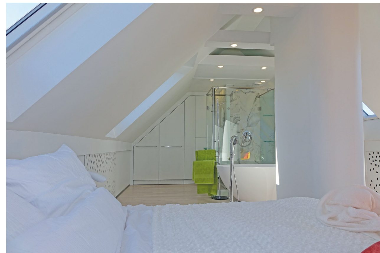
On the first level are an anteroom, living room, kitchen, dining room, guest bathroom and a bedroom with en-suite bathroom