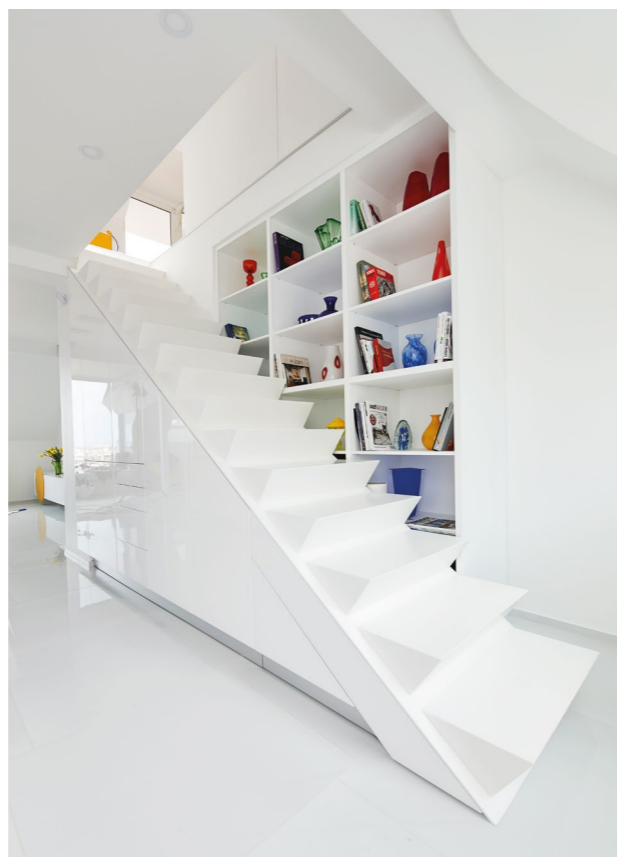
Glossy white steps with under-stairs storage lead to the upper level where the master bedroom is located