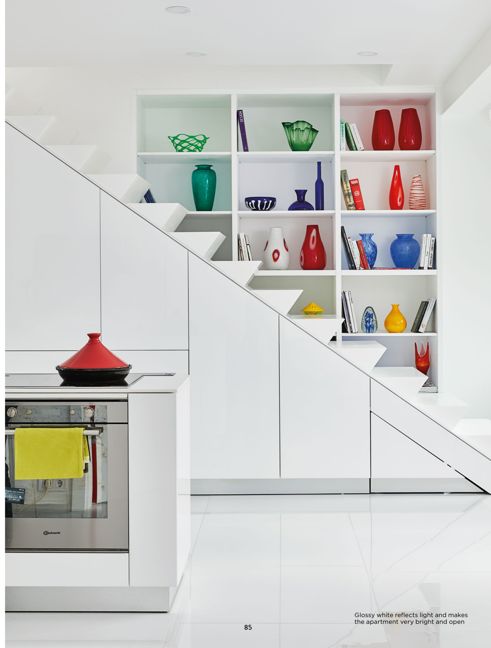
Glossy white reflects light and makes the apartment very bright and open